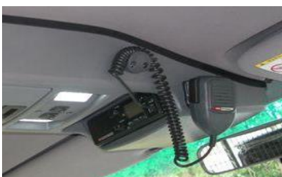
Microphone clip on slight angle

Install in a position that suits best, depending on vehicle and Radio model. Ensure microphone or microphone cable and holder does not foul on sun visor when pulled down.