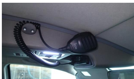
Left hand cable outlet radios