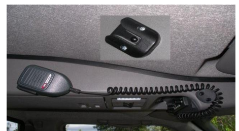
Microphone clip on acute angle